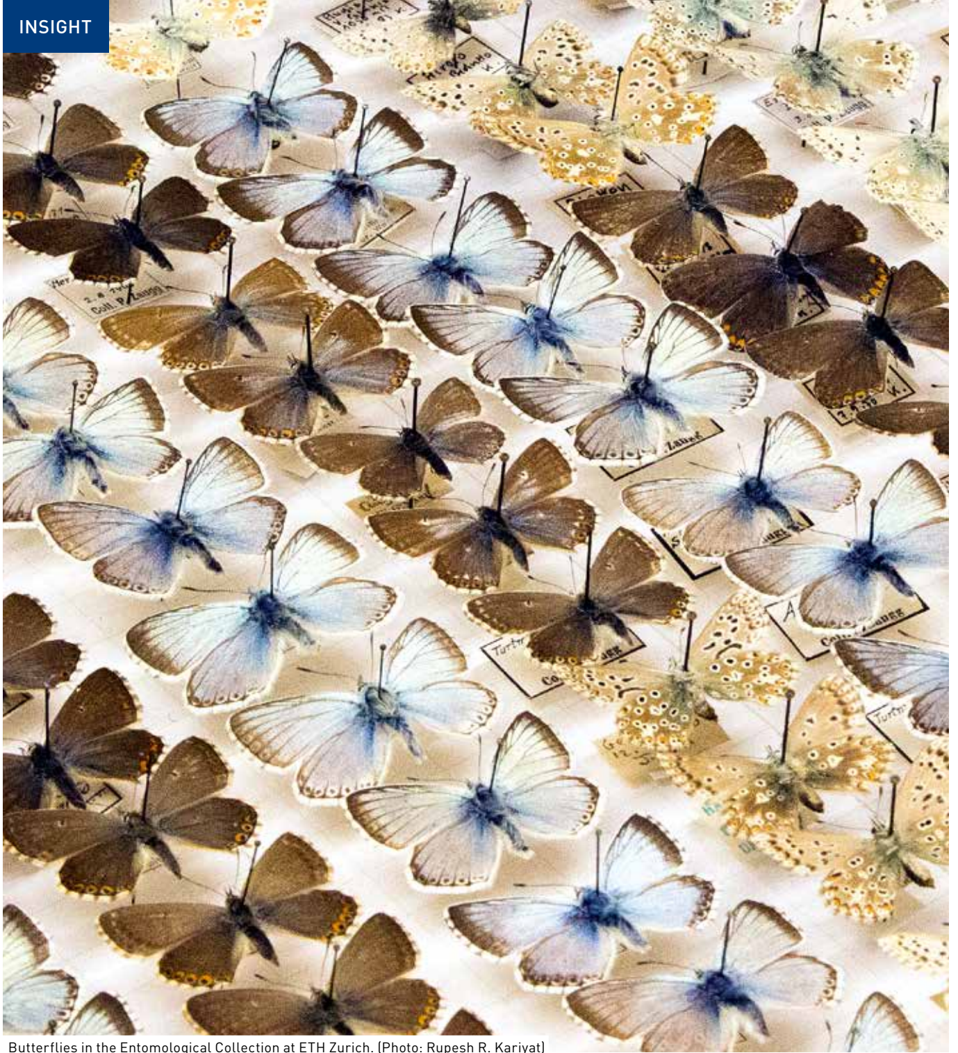
Butterflies in the Entomological Collection at ETH Zurich.