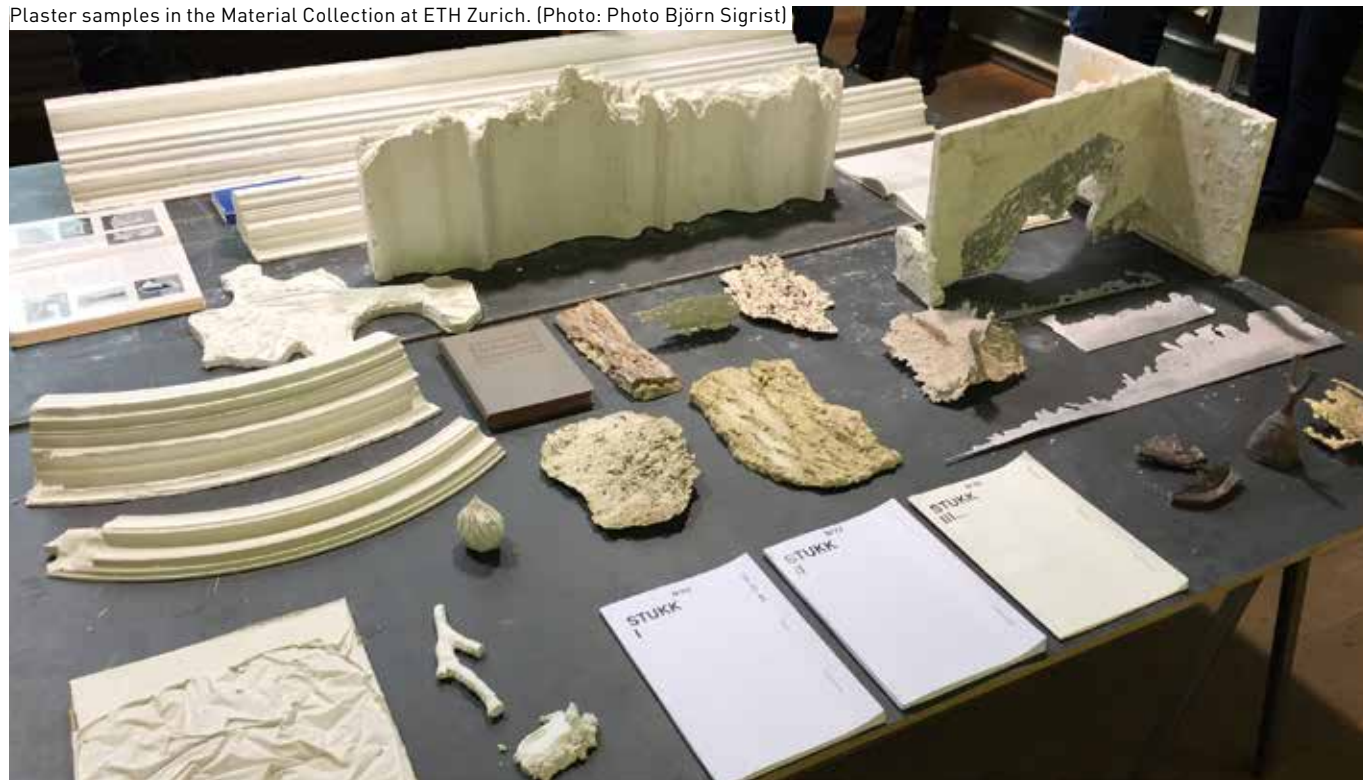
Plaster samples in the Material Collection at ETH Zurich.